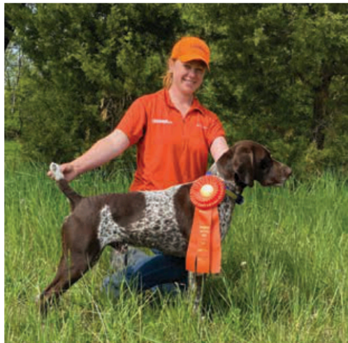
"JJ," MBISS MBISOH GCHG CHRISHELLE'S I LOVE ROCK 'N ROLL CDX RAE RM MH CGC VCX, pictured with Master Hunter ribbon and as Best in Show Veteran.

Dem Norden GSPs in North Dakota. She proved herself in the field quickly, bringing home the birds season after season for my husband who was an avid deer hunter, now learning the ropes of bird hunting. I grew up with Lhasa Apsos. My mother showed the dogs when I was young, but she had to put breeding and showing on the back burner just as I came of age to do Junior Showmanship. My exposure to the dog show world was minimal until I was in college and my mom acquired her next show dog.